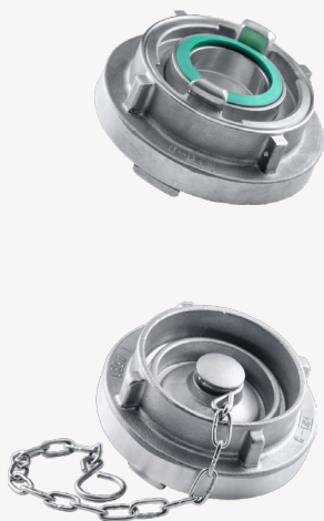
stainless steel (1)