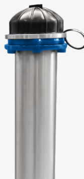
other norms (4)