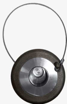
safety lock (2)